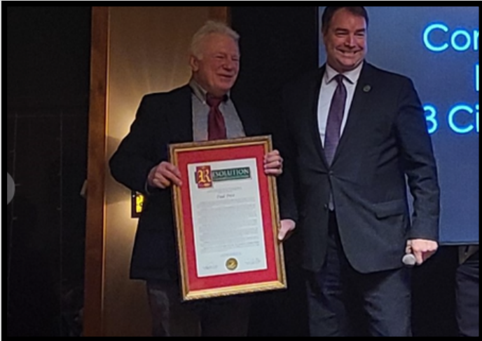
PRESENTING NOVATO'S CITIZEN OF THE YEAR AWARD AT "PAINT THE TOWN RED" FOR NOVATO'S BIRTHDAY

Though the Assembly went back into session in Sacramento at the beginning of January, I have still had many great opportunities to attend events, tours, and productive meetings with constituents throughout the North Bay in both Marin and Sonoma Counties. Here are some snapshots of some of the meetings and events my office participated in over the past month. As always, our door is open, if you want to schedule a meeting or send an event invite, please reach out through our website by clicking here .