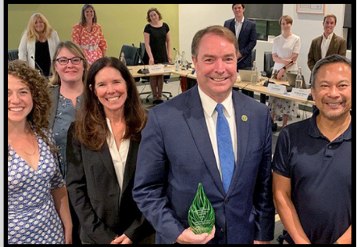
CLIMATE ACTION LEADERSHIP AWARD FROM MCE