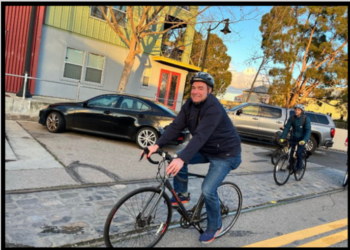
FIRST FRIDAY COMMUNITY BIKE RIDE IN PETALUMA