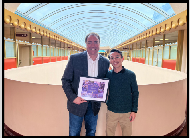
RECEIVING THE ADVOCATE FOR HEALTHCARE JUSTICE AWARD FROM SEIU-UHW