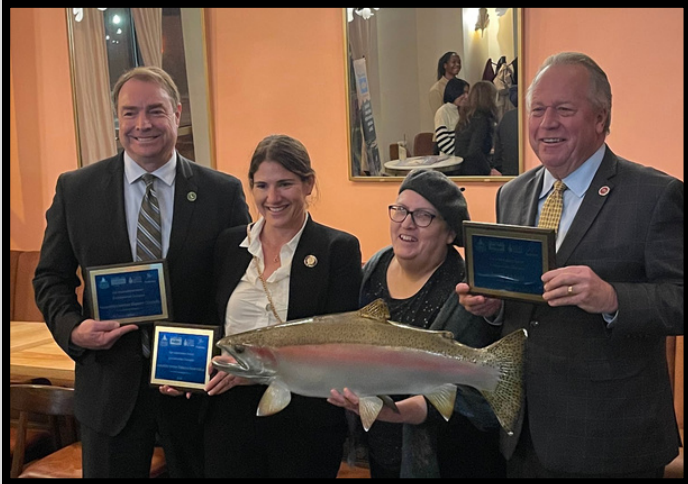
ENVIRONMENTAL CHAMPION AWARD FROM AUDUBON CALIFORNIA AND CLEAN WATER ACTION