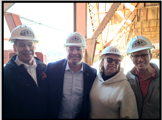
TOUR OF THE GOLDEN GATE BRIDGE WITH THE BAY AREA CAUCUS